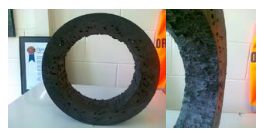
Figure 1. Effects of excessive moisture in pipe compound on PE pipe: voids in the pipe wall (left) and rough surface of inner pipe wall (right).

During extrusion of high-density PE (HDPE) pressure pipe, moisture in the pipe compound can generate steam in the melt exiting the extrusion die due to a drop in pressure. The steam can cause bubbles to form in the melt, which, on cooling, lead to voids in the pipe wall and pitting on the inner surface as shown in Figure 1.