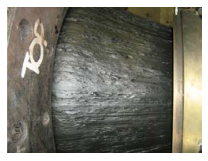
Figure 2. Excessive moisture in the pipe compound affects the quality of the finished pipe, including the appearance of the outer surface of the pipe wall. Picture shows moisture affected pipe surface during pipe manufacturing between the extruder die and sizing calibrator.