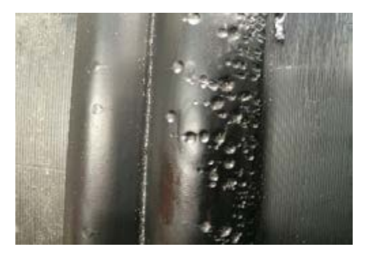
Figure 3. Example of a butt weld of black PE pipe affected by moisture at the jointing surface.

Typically, installation standards specify that pipe should be installed within 1 year of manufacture, while some industry codes allow 2 years. Experience at Qenos acquired over many years suggests that if well-made pipe is installed during the specified time of 1 to 2 years from manufacture, any additional moisture absorbed by the pipe during storage will not present problems during installation.